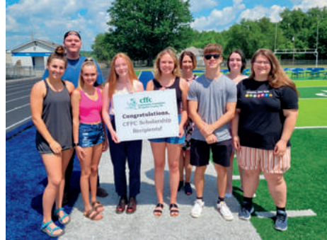
Connellsville Area High School