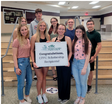
Uniontown Area High School