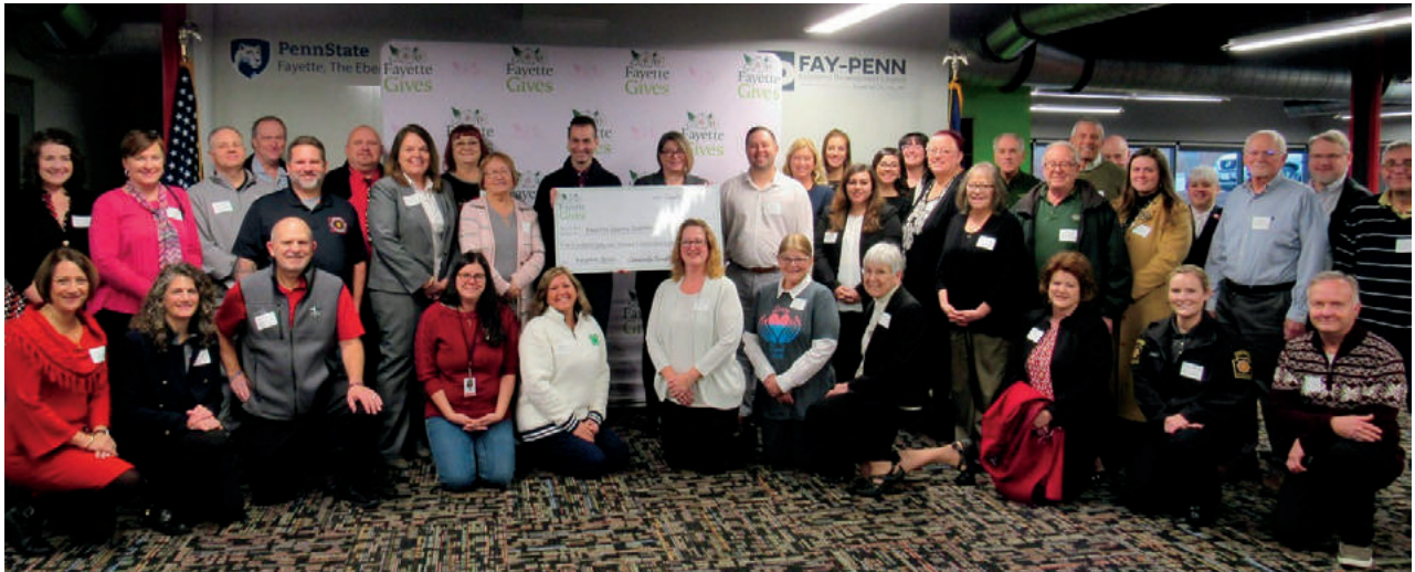
Charities at the Fayette Gives 2022 Grand Finale Event at the Fayette LaunchBox

Save the date for the next Fayette Gives on November 9, 2023! Visit www.fayettegives.org to learn more.