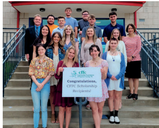
Laurel Highlands High School