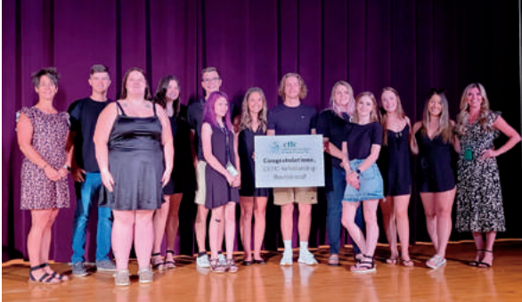
Albert Gallatin Area High School

Post-secondary scholarships for 2023-2024 are available online February 1, 2023 through April 30, 2023.